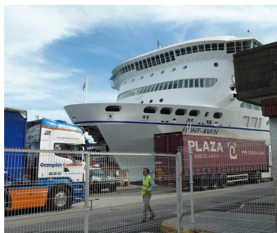
Brittany Ferry - Pont Aven

A group of 30 joined together to visit the Rioja Region in Northern Spain, leaving on Tuesday 8 May 2012 and returning on Tuesday 15 May. It was new territory for almost everyone and proved to be a very interesting and enjoyable experience for all concerned.